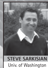
STEVE SARKISIAN Univ. of Washington