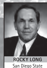
ROCKY LONG San Diego State