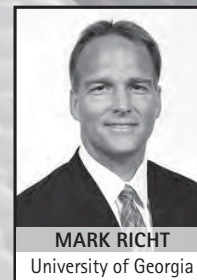
MARK RICHT University of Georgia