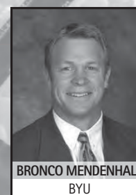
BRONCO MENDENHALL BYU